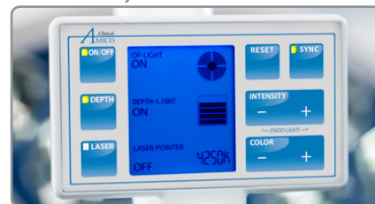
Electronic Key Pad

Electronic key pad allows adjustments to endo light setting, light intensity control, depth control of center pod and color temperatures for Multi Color series.