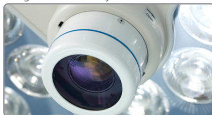
Integrated Camera System

Mounted off-center on the light head, the camera ensures the entire surgical process is captured. Available in both standard and high definition to fit various budget ranges.